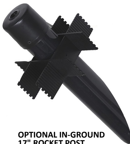
OPTIONAL IN-GROUND 17" ROCKET POST