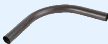
Mounting Arm Kit