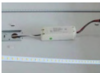
6. Fasten the magnetic strip and driver in the troffer.