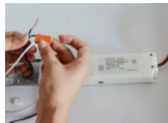
4. Connect the output line of driver and power line.