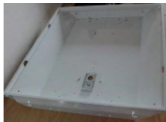
3. Remove other irrelevant parts of the troffer.