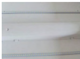
7. Close the cover of the driver. 8. Affix included caution labels to fixture so they are visible to bulb installers.