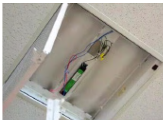
2. Remove the ballast.