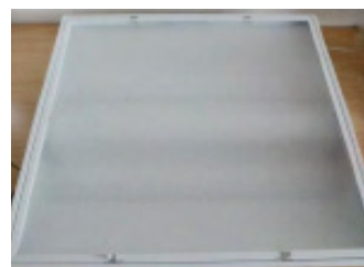
9. Close the cover of the troffer.