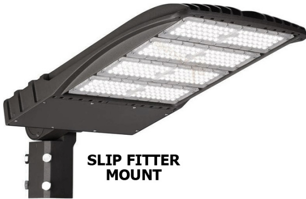
SLIP FITTER MOUNT