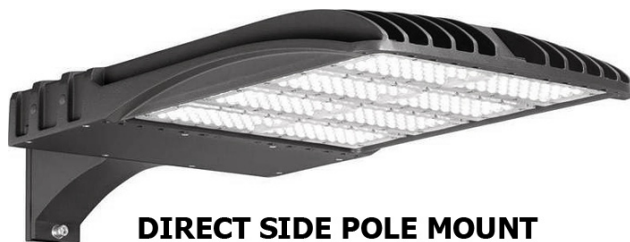
DIRECT SIDE POLE MOUNT