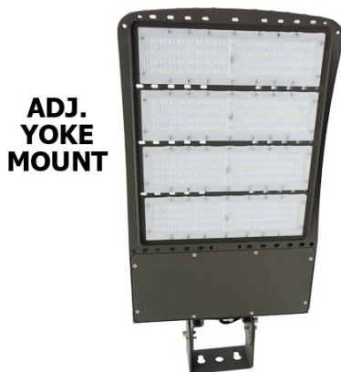
ADJ. YOKE MOUNT