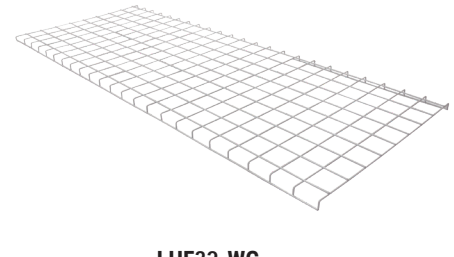
LHF32-WG Wire guard for LHF22